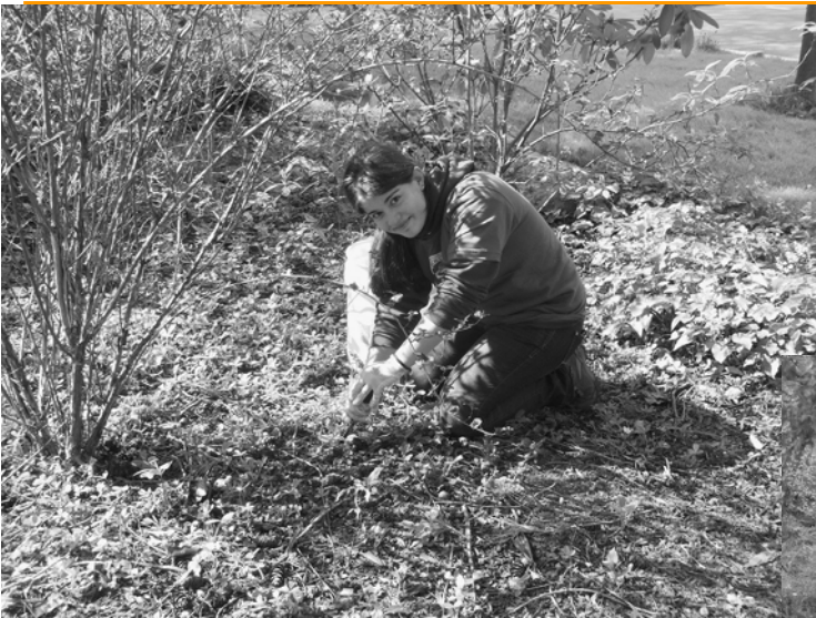
Above: cleaning up old tree sites and dressing with loam