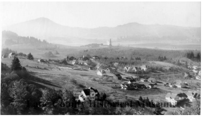
Oil derrick in landscape.

My house, located near the corner of Columbia and 26<sup>th</sup>, had an orchard on the back (east side) of its property, and I wanted to further research its fruit history and production. Working through the historic photo collection at Lane County Historical Museum, I found this image by Chester Stevens from c. 1927. Lo and behold, there was an oil derrick "operating" not far from our house.